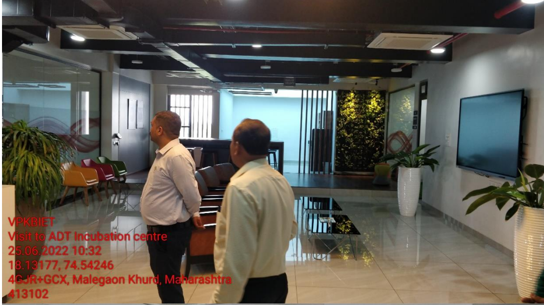
VPKBIET Visit to ADT Incubation centre 25.06.2022 10:32 18.13177, 74.54246 4GJR+GCX, Malegaon Khurd, Maharashtra 413102