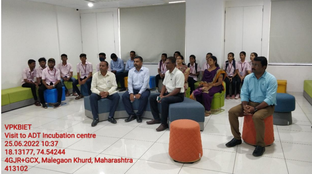
VPKBIET Visit to ADT Incubation centre 25.06.2022 10:37 18.13177, 74.54244 4GJR+GCX, Malegaon Khurd, Maharashtra 413102