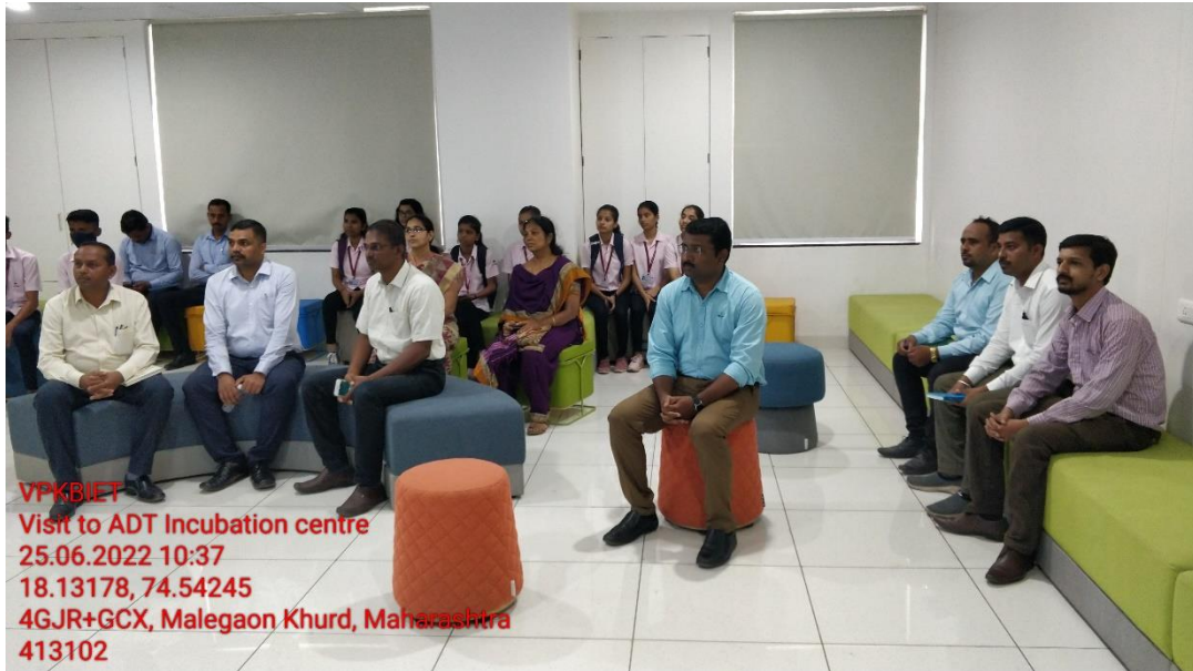
VPKBIET Visit to ADT Incubation centre 25.06.2022 10:37 18.13178, 74.54245 4GJR+GCX, Malegaon Khurd, Maharashtra 413102