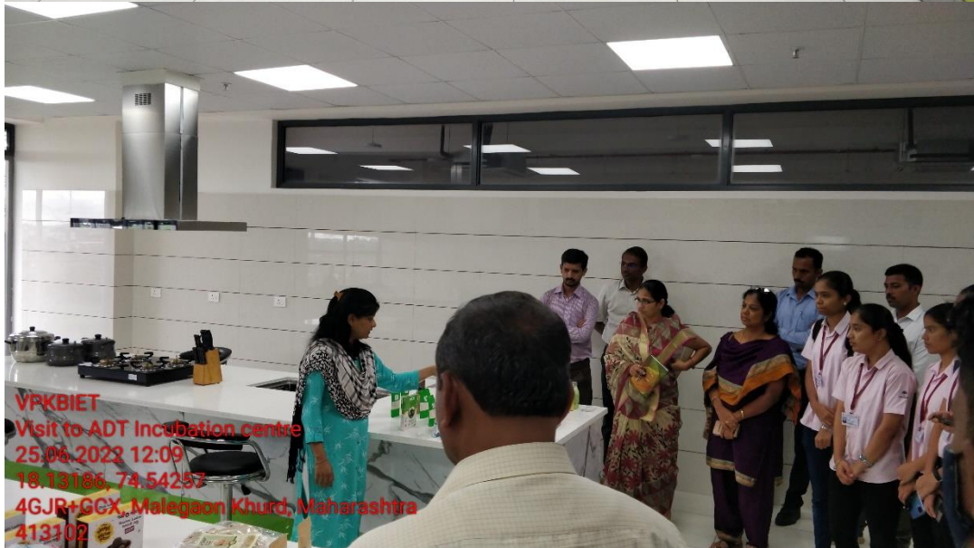
VPKBIET Visit to ADT Incubation centre 25.06.2022 12:09 18.13186, 74.54257 4GJR+GCX, Malegaon Khurd, Maharashtra 413102