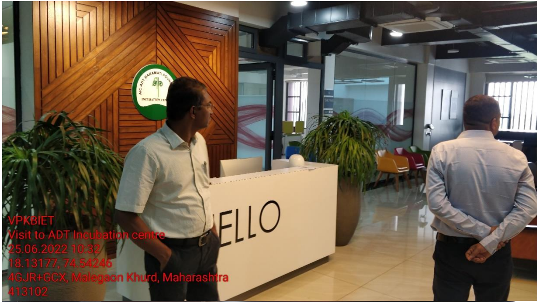
VPKBIET Visit to ADT Incubation centre 25.06.2022 10:32 18.13177, 74.54246 4GJR+GCX, Malegaon Khurd, Maharashtra 413102