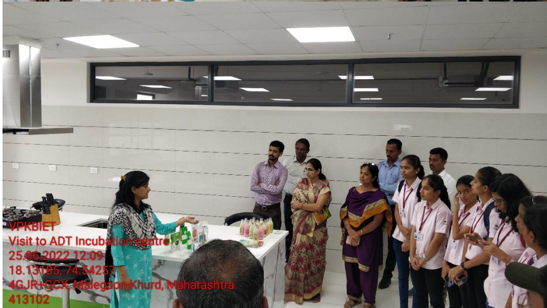
VPKBIET Visit to ADT Incubation centre 25.06.2022 12:09 18.13186, 74.54257 4GJR+GCX, Malegaon Khurd, Maharashtra 413102